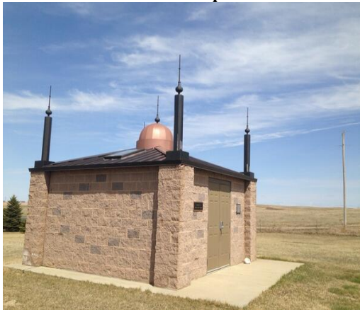
Ross North Dakota Mosque -- Contemporary Image

Substantial immigration from the Middle East, North Africa and South Asia began after the Second World War when what was essentially a “white only” immigration policy ended. Today there are approximately 3.3 million Muslims in the United States or about one percent of the population. Islam is growing at a faster pace than other religions due to immigration, conversion and higher than average birth rates. The American Muslim community is ethnically and religiously diverse. Approximately 34% of American Muslims come from South Asian (Bangladesh, India, Pakistan) backgrounds, 26% are Arab or