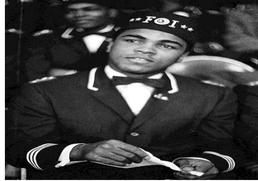
Muhammad Ali – Wearing a Nation of Islam Uniform

Ali was consistent in his opposition to violence throughout his life, a position he linked with his Muslim faith. In 1990 personally negotiated the release of American hostages in Iraq. He was recognized by the United Nations as an Ambassador for Peace in 1998 and awarded the Medal of Freedom by US President George W. Bush in 2005.