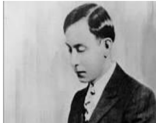
Wallace Fard Muhammad

story or from Mecca according to another. He preached that white people are devils and that if African Americans return to Islam, Allah will overthrow the oppressive white system, and return them to their original home. 33