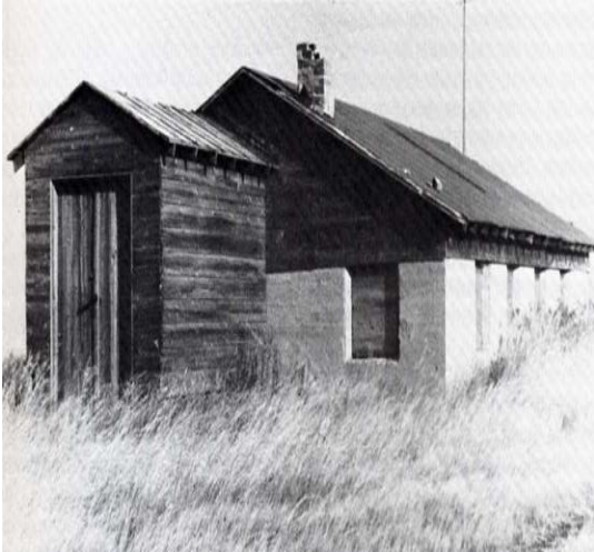
Ross North Dakota Mosque -- Circa 1930