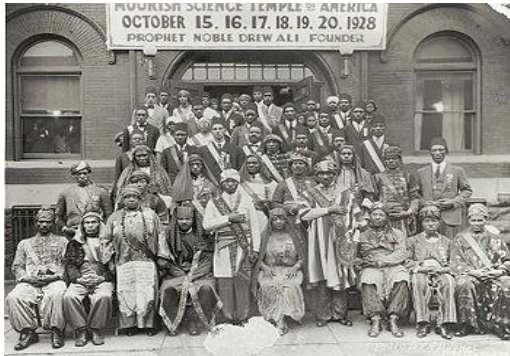
Moorish Science Temple of America, National Convention 1928 Noble Drew Ali, Front Row Center, Dressed in White

American flags are often displayed at MSTA events.